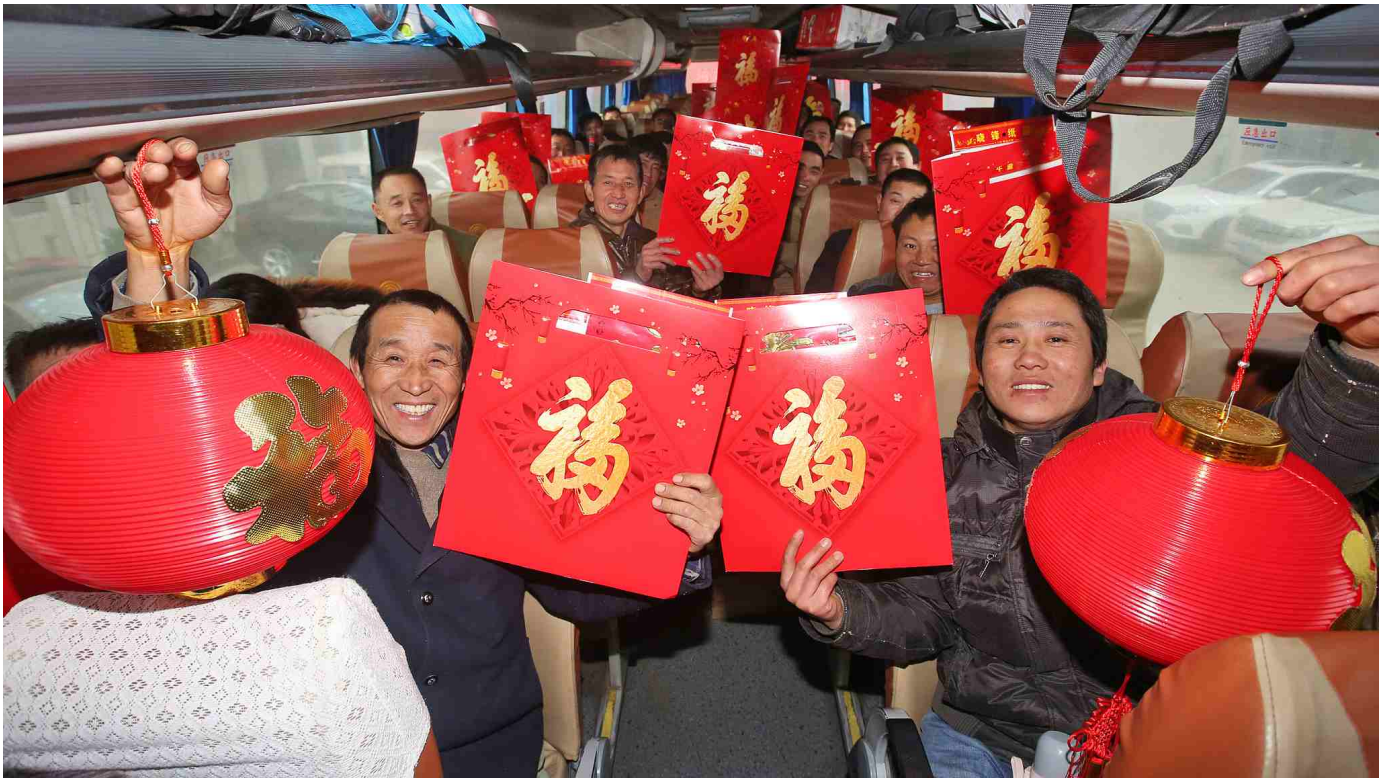
Migrant workers receive their pay before the Spring Festival, Changzhou City, Jiangsu Province, January 18, 2020.

With the Spring Festival approaching, Chinese Premier Li Keqiang urged officials to make sure migrant workers get their full pay on time at a State Council executive meeting on Wednesday.